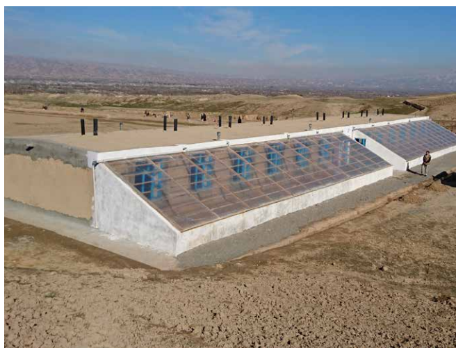
Photo 1: The new energy efficient poultry farm in Takhar has eight growing cycles per year and has a potential gross profit margin of $16,000, making it a great investment opportunity.

Each function of the Value Chain is confronted with many challenges specific to the area of enterprise development. Innovation therefore is a key component of the program, and this together with the introduction of new technologies and improved measures has a direct effect on the region's economic performance.