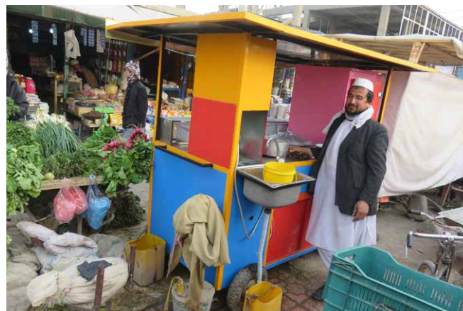
Photo 8: Balkh will now see 10 milk carts operating on the streets of Mazar-e- Shafi this year.

With the support of SEDEP, Pakiza dairy has introduced a new business model established around the mobile milk cart that sells fresh milk together with yoghurt and cheese. Building on the success of the pilot it is planned to develop this enterprise model in four other Provinces (photo 8).