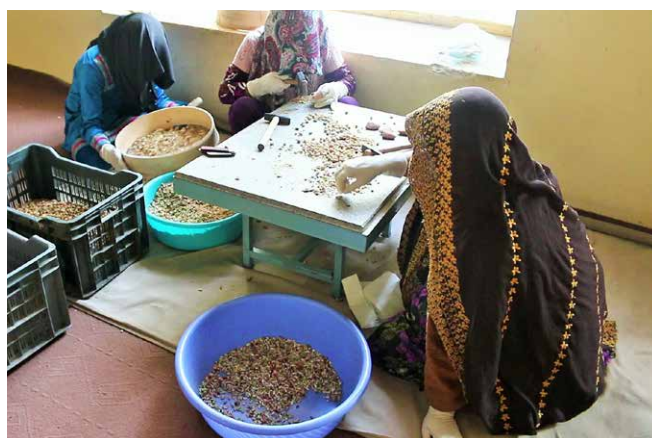
Photo 5: Rural Nut cracking women have been supported with new equipment and trainings to upgrade their skills on primary processing and the production of a better quality nut product for the regional market. The women have also tripled their income.

In 2015 SEDEP supported 1470 rural nut cracking women who have received improved equipment and tool kits together with technical, business and life skill training courses to improve their processing techniques. The women have also been organized into small working business groups that are linked to the Nuts Associations to ensure continued support in producing a standardized quality. The establishment of this small business model has tripled the earnings of the women and subsequently, this year, SEDEP will expand on the success and target an additional 3750 rural women (photo 5).