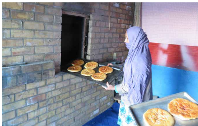
Photo 11: A group of women in Rabia Balkhi market has been supported with upgrading their existing business with the installation of a new energy efficient oven.

One business that benefited from the support from SEDEP is the Balkh women association. With the installation of new improved energy efficient ovens for the bakers, this has resulted in reduced production costs, more jobs, increased income, and new products for the local market (photo 11).