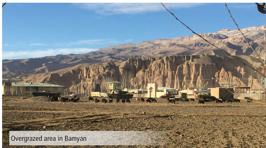
Overgrazed area in Bamyan