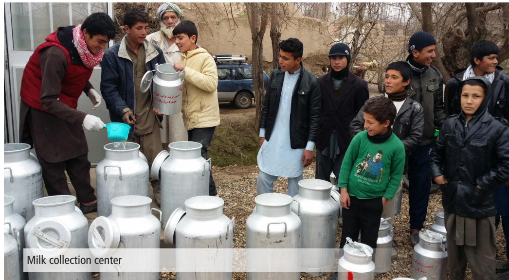
Milk collection center

A monitoring unit has regularly collected data and provided qualitative and quantitative analyses. In 2015, SEDEP reached more than 11,000 small businesses in Northern Afghanistan through