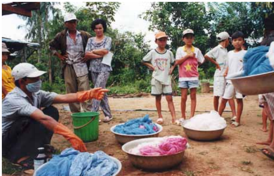
Disinfection of nets for malaria prevention

Funding is based on contracts that clearly describe outputs, e.g. number of people treated, number of bed nets distributed, etc. At country level, the Country Coordinating Mechanism (CCM) is composed of key stakeholders in response to the three diseases. The CCM does not handle financing of The Global Fund itself, but is responsible for submitting proposals to the fund. The latter signs a legal grant agreement with a Principal Recipient designated by the CCM. The Principal Recipient receives fund financing directly, and then uses it to implement prevention, care and treatment programs or passes it on to other organizations (sub-recipients) that provide those services. The Global Fund contracts firms to act as Local Fund Agents (LFAs) to monitor implementation. The Global Fund Secretariat based in Geneva manages the grant portfolio: screening proposals, issuing instructions to disburse money to grant recipients and implementing performance-based funding of grants. The Technical Review Panel is an independent group of international experts in the three diseases which meets