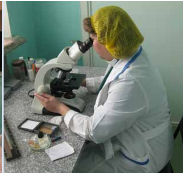
Measures in the fight against HIV/AIDS, TB and malaria