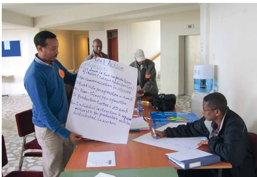
SLM project stakeholders participate in a C 3 Train the Trainer workshop in Addis Ababa

The training focuses on practices useful for reducing land degradation. Trainers inform a Best Practices Task Force on country-wide experiences in the field. Consequently, the task force decides which routines deserve to be elaborated as nation-wide Best Practices integrated into the SLM program. These are best practices as such: effective in a specific Ethiopian context and region. Lengthy discussions about what was good, what was better and what was best may take time and absorb valuable human resources. But practices that have proven effective should be disseminated at a larger scale. Ultimately, it will be farmers who decide which innovation or new practice is adopted and which is rejected. Hence, while the growing pool of Best Practices is a success it may deserve a more modest label.