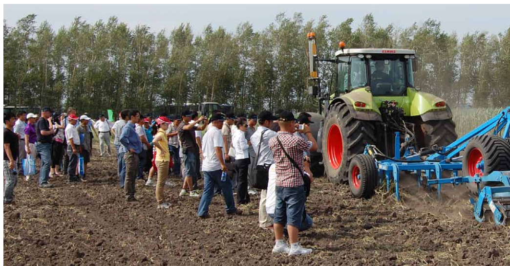
Field day and machinery demonstration in Ganhe

Contact Joachim Frederik Tipp frederik.tipp@gfa-group.de