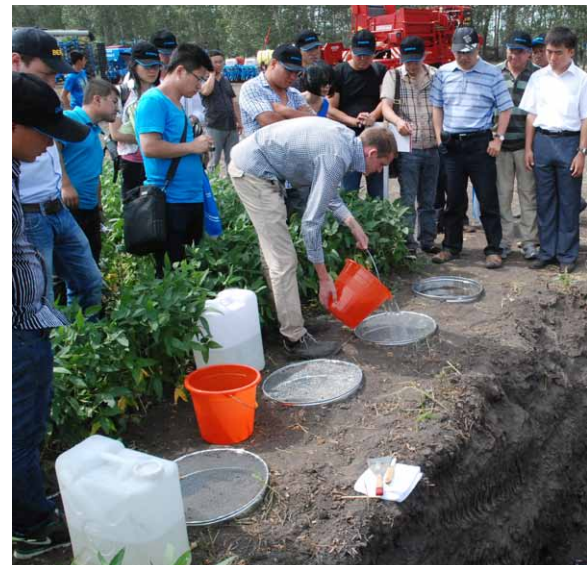
Demonstrating soil filtration capacity

During a meeting of German chancellor Angela Merkel and Chinese Premier Li Keqiang in May 2013, a Memorandum of Understanding was signed to increase bilateral cooperation. A Sino-German Center for Food and Agriculture will be established as an umbrella for all bilateral BMELV activities in China. BMELV and GFA have initiated discussions with relevant stakeholders from the entire German agricultural and