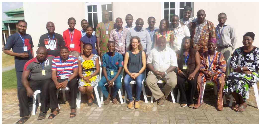
Local trainers from the agricultural sector and their trainers and coaches during the ToT in Abeokuta, Nigeria

In order to reach out and to develop local know how and skills, a cascading approach was chosen. The first ToT scheme aimed at developing and testing training material for a course for TVET students as end users. The assignment also aimed at training and coaching TVET teachers in a train-the-trainer course and during their first implementation of six one-day courses for students in a second step. This laid the ground for good training quality with respect to action-oriented didactics and the subject matter (market and marketing) after the completion of the assignment, so that teachers can continue teaching the subject with new students at a later stage. The second ToT scheme followed the same