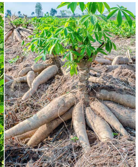
Making business with potatoes and cassava