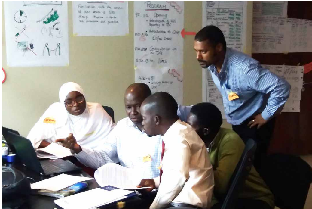
Group work fosters eager exchange amongst participants, Lagos/Nigeria

GFA's concept for capacity building is based on continuous accompaniment and improvement of the national entities' capabilities, tailored to the national entities specific needs. To complement the daily coaching on the job, training modules covering key topics were developed and course prototypes tested in Nigeria and East Timor throughout the year.