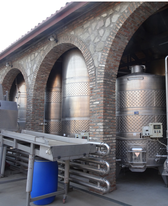
Vine pressing plant in Georgia