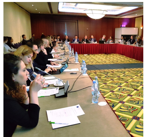
Workshop in Georgia