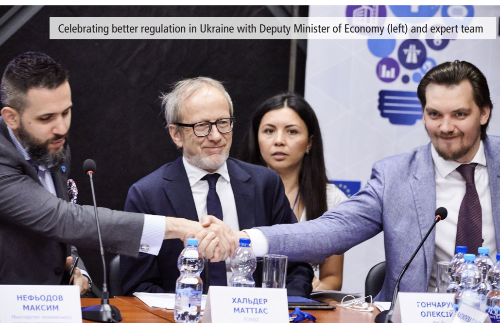
Celebrating better regulation in Ukraine with Deputy Minister of Economy (left) and expert team

GFA has been providing technical assistance for DCFTA implementation in Moldova as an important step towards the association of Moldova with the EU from August 2015 to August 2017. In one field of intervention, GFA supported institutional strengthening of public agencies in quality infrastructure, market surveillance, export and investment promotion. The experts developed a number of regulations such as the modification of the Law on Accreditation and Certification, the regulation of operations of the National Institute of Metrology, multi-annual institutional plans and the adoption of laws on market surveillance and general product safety. National standards were harmonized with EU standards, and a detailed plan for full implementation of the DCFTA chapter dealing with the adoption and enforcement of technical regulations for different industrial products was drafted. In order to support Moldovan exports and foreign investments, GFA experts implemented sector analyses, supported export missions and events of Moldovan companies, and facilitated the adoption of a national export promotion strategy. The project supported the creation of new women-owned businesses as well. GFA consultants advised the State SME Agency on the implementation of the Women in Business National State Programme, and a Women Access to Finance Programme.