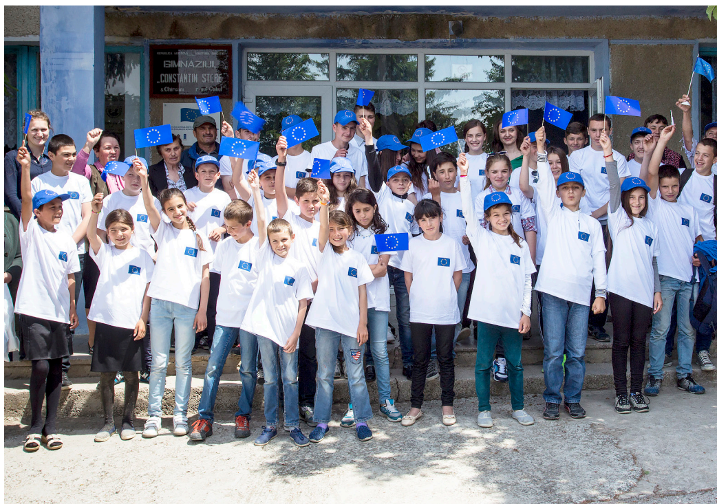
Kids celebrating the EU in Moldova

In this context, GFA is currently implementing projects related to public sector reform, creating better economic regulations, rearranging small and medium enterprises (SME) and innovation policies, improving aspects of trade policies and export and investment promotion, and providing finance to SME.