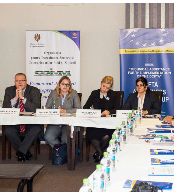
Workshop in Moldova