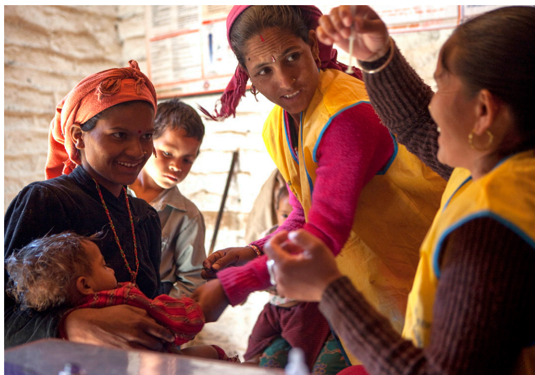
GFA strengthens access to quality health services for all

SDG target 3.8 specifically aims at UHC, namely financial risk protection, access to quality essential healthcare and access to safe, effective, quality and affordable, essential medicines and vaccines for all. In addition to the SDGs, the UHC2030 movement ( www.uhc2030.org ) aims at building stronger health systems for UHC. It provides a multi-stakeholder platform for promoting national and global collaboration in health system support. As such, UHC can be considered the overall vision while strengthening health systems includes specific steps to achieve this vision.