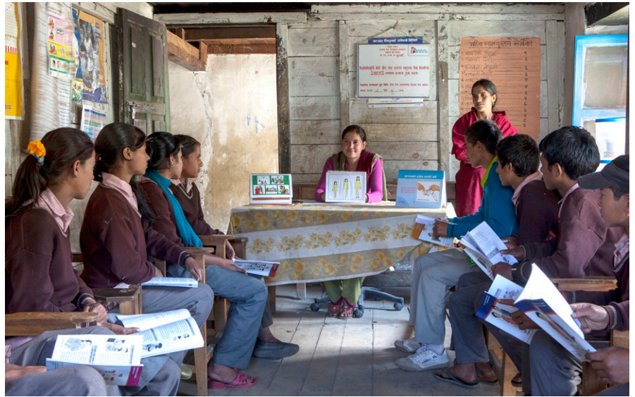
GFA follows a people-centered approach improving health literacy

GFA has been providing international and national short-term advice to improve the quality in three public secondary care hospitals in the Republic of Moldova since 2016. This is part of the GIZ-funded Quality improvement of health services project in cooperation with the Moldovan Association of Private Health Care Providers (UIMSP).