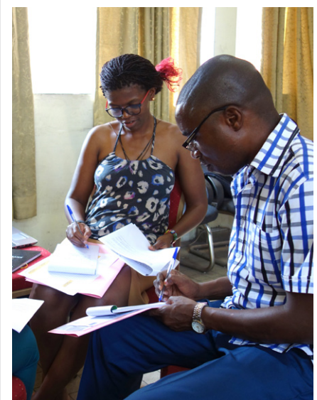
Training of health staff in mHealth