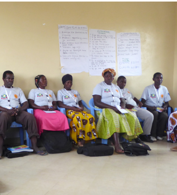
Preparing a communication campaign

build capacity of the government and hospital staff to manage hospitals within this new legal environment. Since 2015, the project has been concentrating on six pilot hospitals in the transition to autonomy. Increasing hospital autonomy is essentially a form of decentralization which shifts responsibility, accountability and decision-making power from the central government to the hospitals. The benefits of hospital autonomy are manifold, including government's responsiveness to local needs by reducing administrative complexity. This enhances effectiveness as well as efficiency of management by allowing greater discretion, and improves governance and the quality of care.