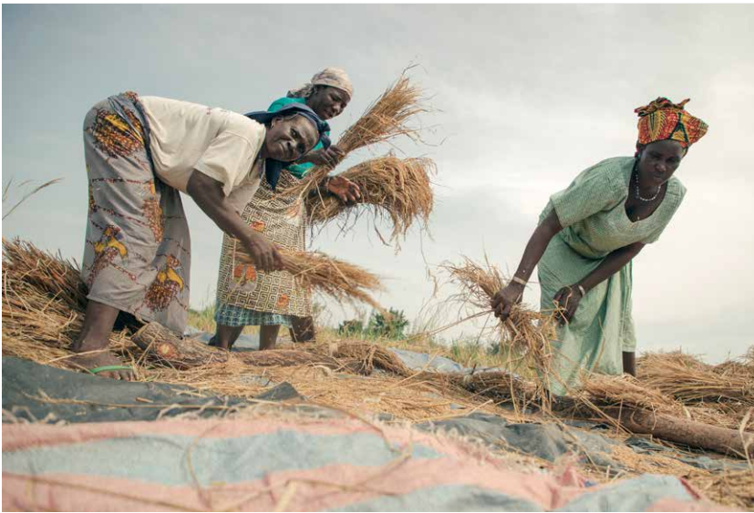
Smart-Valleys: Women shaking out rice kernels from dried plants during rice harvest