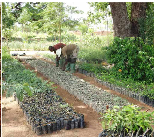
Tree nursery at the innovation centre in Matéri