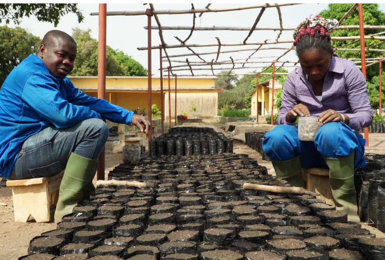
Introducing new cashew tree nursery techniques