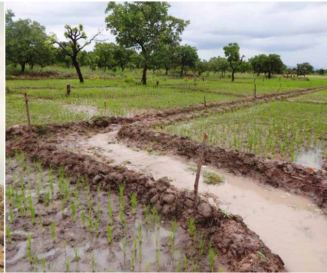
Improved water management during the rainy season

change resilient varieties to local farmers. Each centre has been producing and distributing more than 100,000 trees annually. Radio Fribourg has broadcast a podcast on one of them. www.radiofr.ch