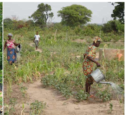
Garden protected with a fence and equipped with a traditional well