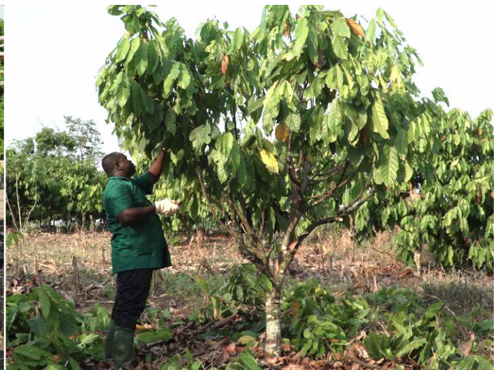
Setting up a demonstration plot for the rehabilitation of cocoa orchards