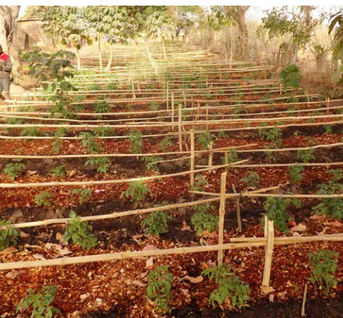
Demonstration garden at the innovation centre in Kérou

The standardization of the procedures developed by PACC allows other stakeholders to identify the needs and potential for agricultural adaptation measures to climate change. The creation of a toolbox and the organization of exchange visits and demonstration sessions at two innovation centers facilitate a wide dissemination of best adaptation practices. At the innovation centres, new techniques have been tested and demonstrated to farmers, extension officers, NGOs and others. More than a thousand people have been visiting each centre every year. The centres do not only provide various trainings but also multiply and distribute seeds of climate