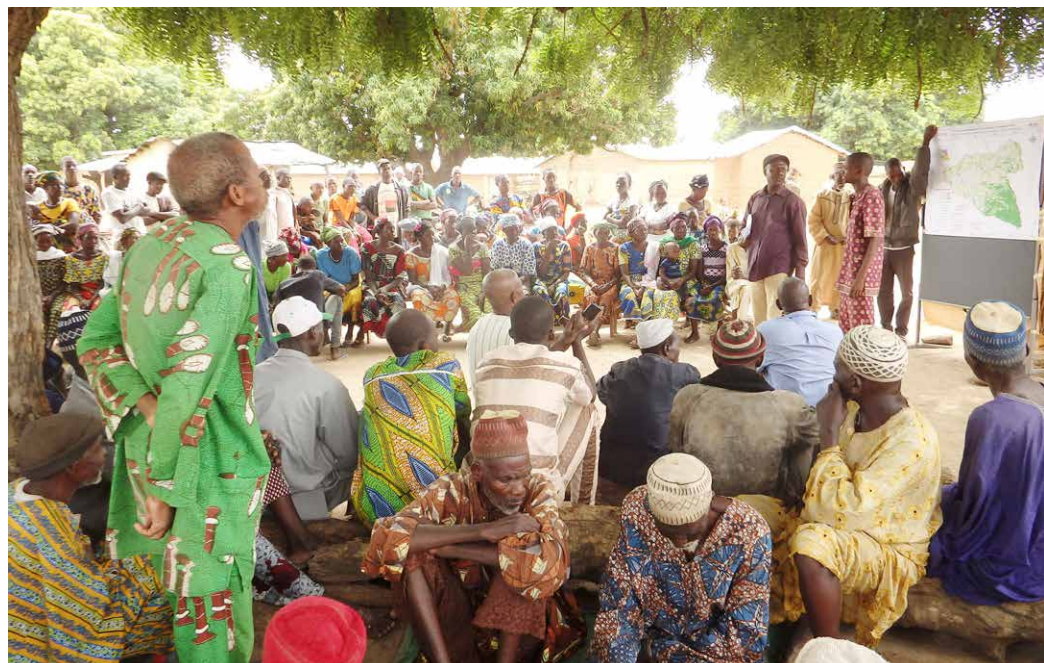
Village assembly during a participatory diagnostic

The Development of the Taï and Comoé Nature Conservation and Economic Areas (PROFIAB II) project of GIZ has been implemented by GFA since May 2016. The project focuses on linking value chain promotion in the peripheral areas of the two national parks Taï and Comoé with simultaneous support to improve the protection of both parks. The approach of the project aims at increasing the competitiveness of cocoa, palm oil, cashew and manioc value chains, and at the promotion of small producers, women and young people through the creation of jobs and additional income in order to achieve pro-poor growth.