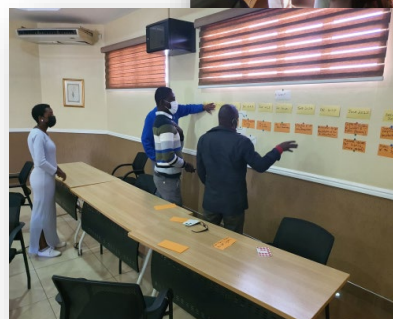
HMIS Workshop July 2021