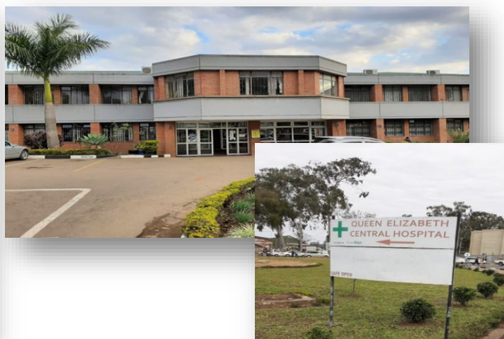
Queen Elizabeth Central Hospital in Blantyre