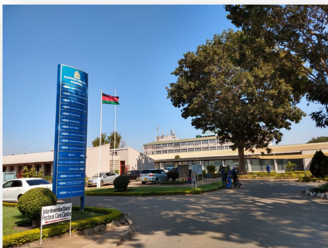
Kamuzu Central Hospital in Lilongwe

The GIZ Malawi German Health Programme (MGHP) has four result areas, which address quality of care, district health management, health information and digitalisation and finally the central hospital reform. Since 2019, GFA Consulting Group GmbH has been contracted by the MGHP to assist with providing consulting services to the Ministry of Health's Department for Planning and Policy Development (DPPD) and two central hospitals (Kamuzu Central Hospital in Lilongwe and Queen Elizabeth Central Hospital in Blantyre) with the implementation of the hospital reform agenda. The services are organised into three work packages that seek to strengthen the (1) organisational capacity at central hospitals, (2) capacity of hospital managers, and (3) legal environment for semi-autonomous central hospitals. The project is in its final phase and focuses on the implementation of strategic plans, strengthening routine data collection of key performance indicators, as well as capacity building of hospital managers and trustees once appointed.