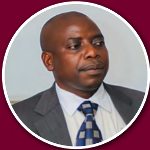
Partner Siabutuba Executive Director