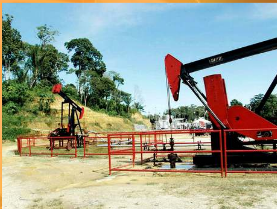
Oil equipment at the Petrotrin refinery in Trinidad

discovery was made by the State owned oil company, Petrotrin Limited. This therefore implies that decision making is simplified, and that the company's profit margins will increase since the Government does not have to share revenues realised with other investors. Further, Petrotrin which sells refined products but does not sell raw crude has in the past been forced to import approximately 100,000 barrels per day of crude oil to suffice its refining capacity of 150,000 barrels per day with local production being only 50,000 barrels per day.