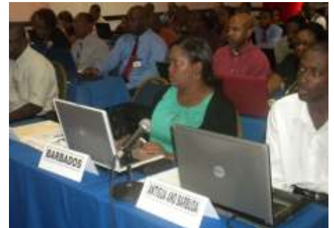
Section of the Audience at RE Project Financing Workshop & RETScreen Training held in Jamaica, March 2012

Forty five persons drawn from Development Banks, private RE firms, and other agencies attended the workshop. Participants were selected based on nominations