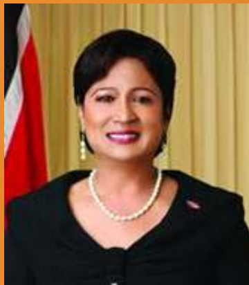
Hon. Kamla Persad-Bissessa Prime Minister of Trinidad and Tobago

News of oil find in Trinidad and Tobago cannot be considered a new phenomenon, given the country's successful experience in the business of oil exploration for more than a century. Then, what could have been responsible for the recent jubilation over recent oil discovery estimated at 48 million barrels of crude which caused the Prime Minister of Trinidad and Tobago, Hon. Kamla Persad-Bissessar to remark jokingly that “ indeed God is a Trini ”.